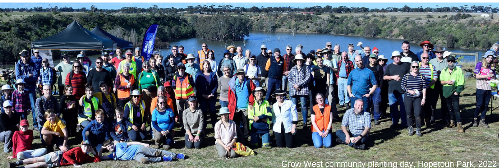
Grow West community planting day, Hopetoun Park, 2022

Melbourne Water coordinates Grow West on behalf of these partner organisations.