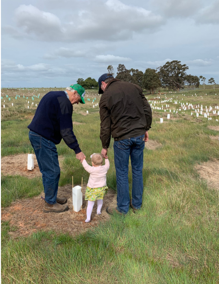
Three generations on the farm