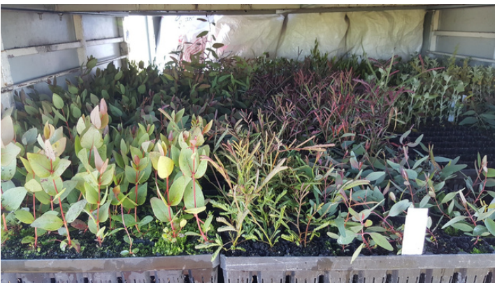
Indigenous species planted on the site