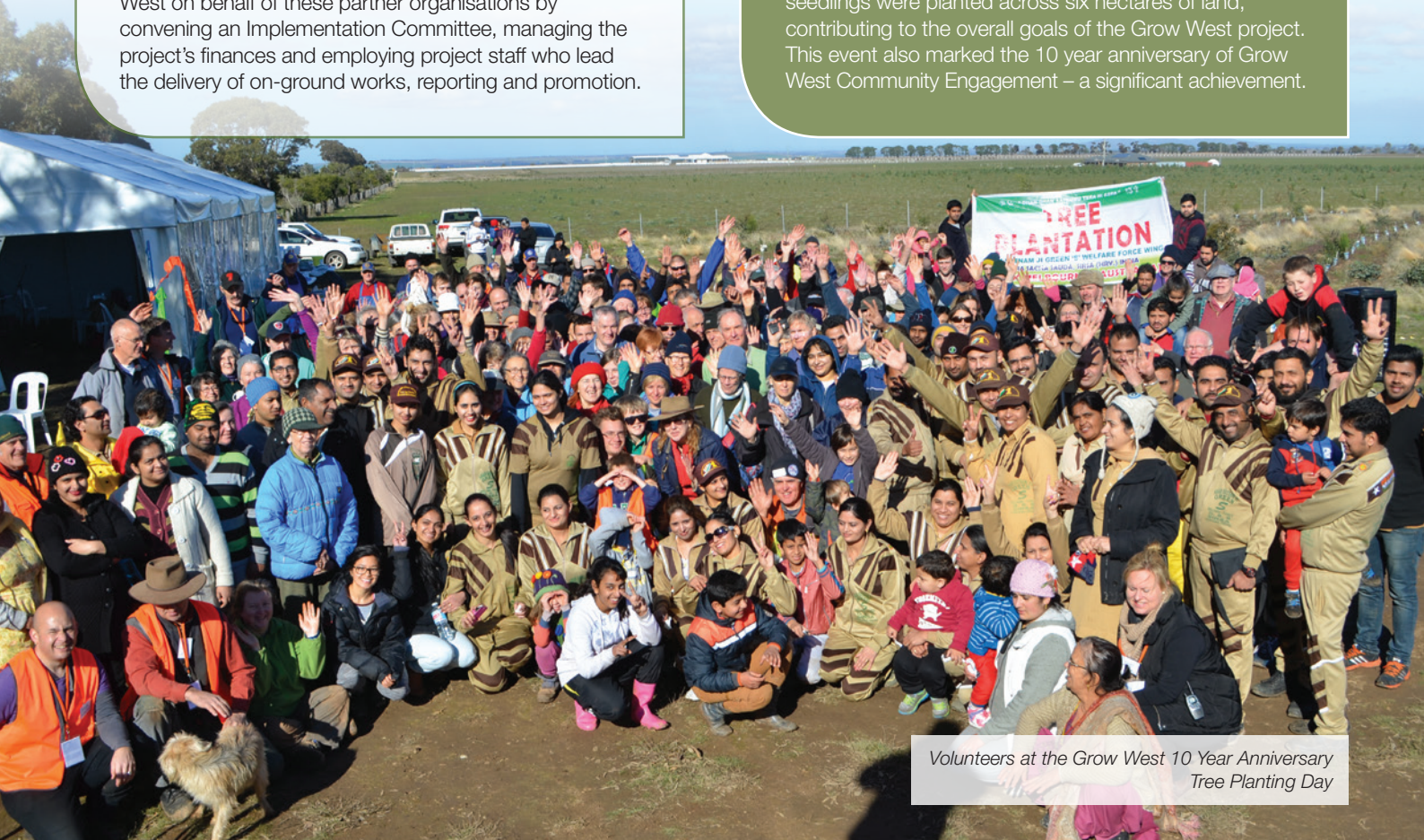
Volunteers at the Grow West 10 Year Anniversary Tree Planting Day

Ongoing emphasis on community engagement was also achieved during 2015/16. At the annual Grow West Community Planting Day, held in July 2015, over 5,000 seedlings were planted across six hectares of land, contributing to the overall goals of the Grow West project. This event also marked the 10 year anniversary of Grow West Community Engagement – a significant achievement.