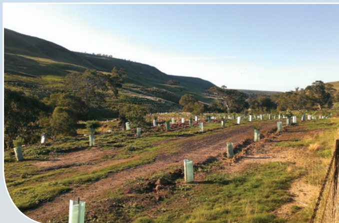
Revegetation works along Whitehorse Creek in the Rowsley Valley

Grow West will continue its engagement with the wider community through the annual Grow West Community Planting Day. The annual event attracts over 200 people from the local community and it is anticipated that this level of engagement will continue.