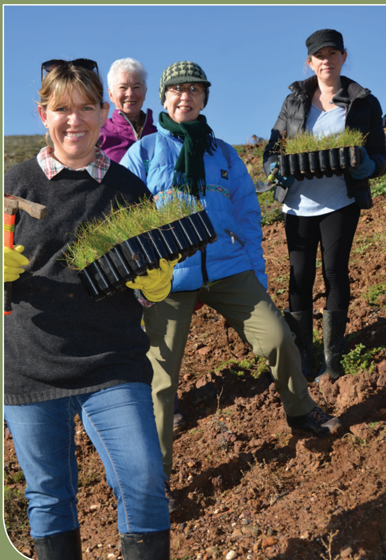
Volunteers take part in Grow West's 10 Year Anniversary Community Planting Day

The event provided community volunteers with the opportunity to take part in practical landscape restoration works and work towards making Melbourne's west greener. The event also provided volunteers with a valuable social and networking opportunity and a great sense of achievement after planting 5,000 seedlings during the day.