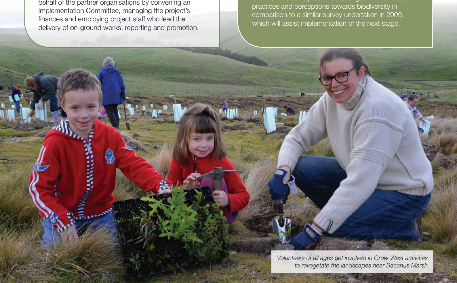
Volunteers of all ages get involved in Grow West activities to revegetate the landscapes near Bacchus Marsh

As part of ongoing planning for Grow West, a landholder survey was also undertaken regarding potential future work to extend the Myrniong and Korkuperimul Creek biolinks. The survey identified changes in landholders' practices and perceptions towards biodiversity in comparison to a similar survey undertaken in 2009, which will assist implementation of the next stage.