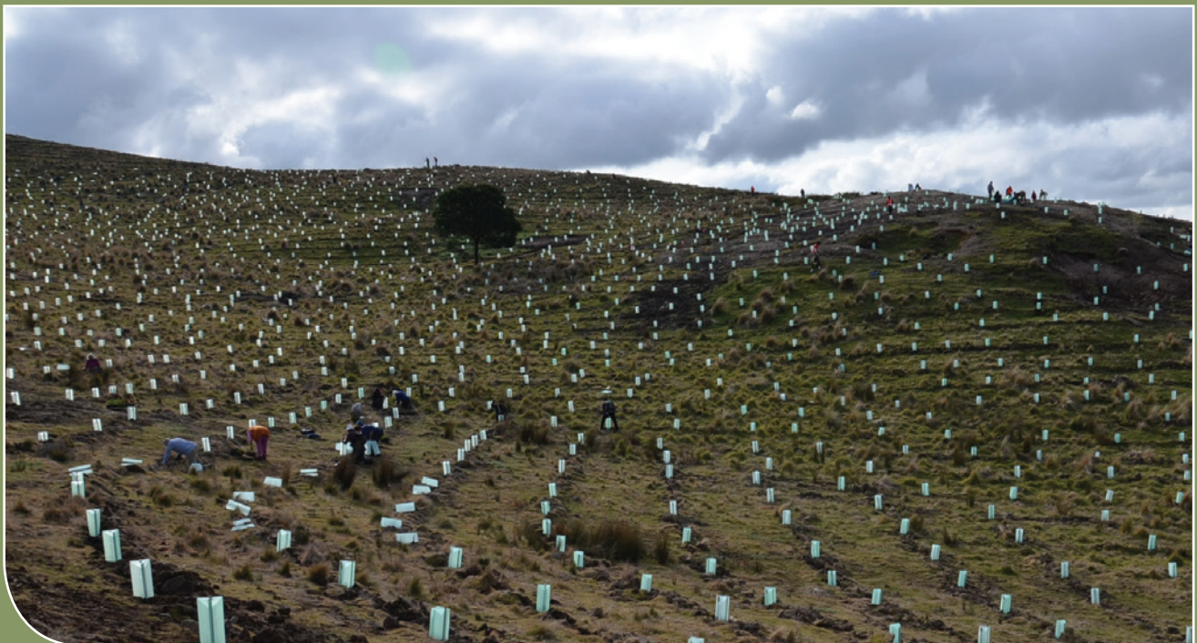
Grow West Community Planting Day

The site for this planting day was on Yaloak Estate in the Rowley Valley. Over the past 12 years, Grow West has worked with Yaloak Estate on numerous revegetation, farm forestry and remnant protection projects and provided assistance with grants, advice and links to specialists and volunteers. The work on Yaloak Estate has helped to suppress Serrated Tussock in the area, reduced soil erosion and sediment entering into the local creeks and contributed to an increase in the biodiversity of the area.