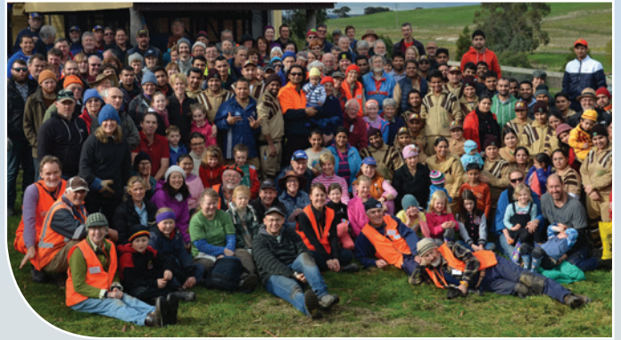
Volunteers at the Grow West Community Planting Day

In 2015/16, Grow West will celebrate more than 10 years of community action at the annual Grow West Community Planting Day. Efforts to secure major funding for revegetation will continue. A list of landholders and sites ready for revegetation is maintained to enable implementation to commence immediately upon the securing of new funds.