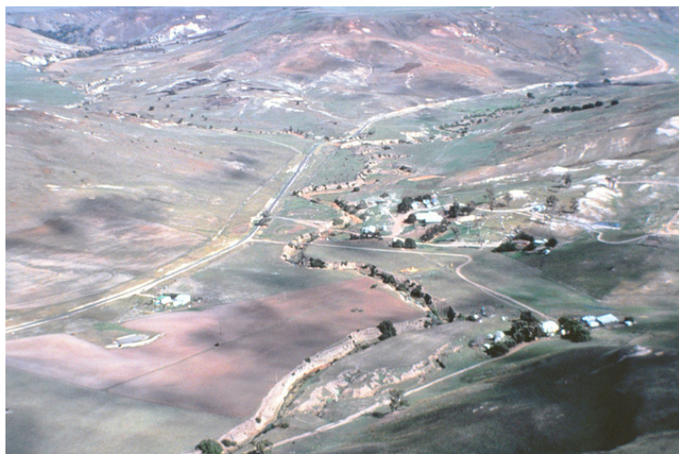
Before (1970). Looking over Yaloak to Cut Hill.

Grow West will continue its 'Protecting and Connecting Species and Communities in Melbourne's West' project with Trust for Nature and Parks Victoria and will start a new 'Peaks to Plains' project with Parks Victoria and Greater Geelong City Council, working on the around You Yangs.