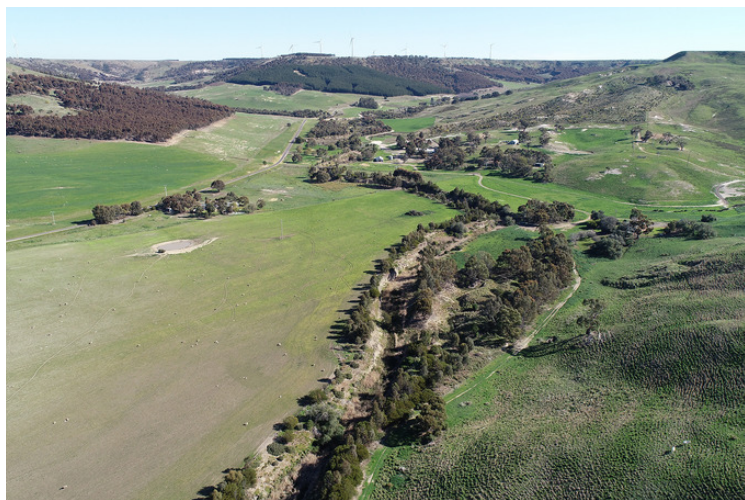
After (2018). Result of Grow West and partner revegetation works.